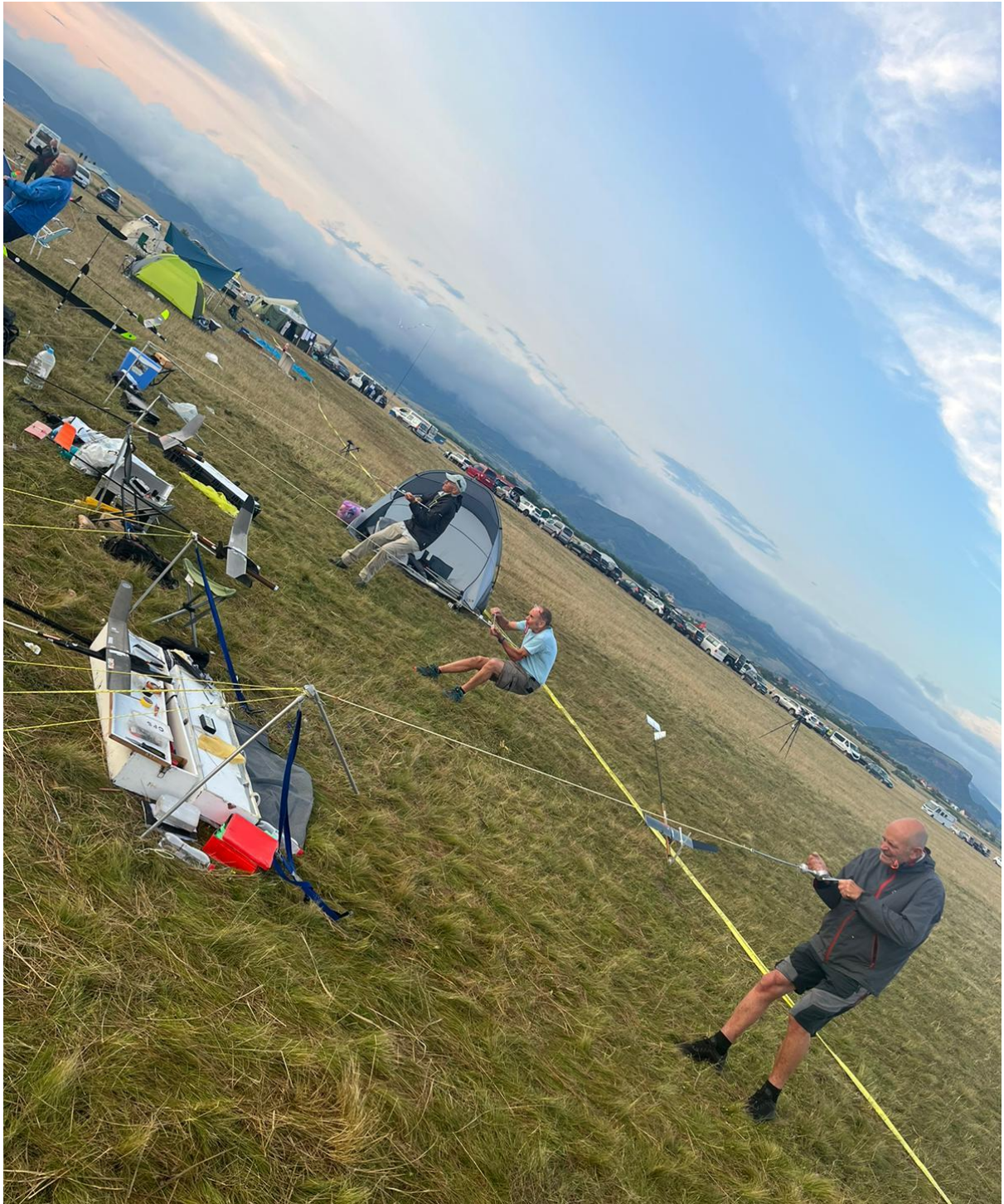
Getting wound up