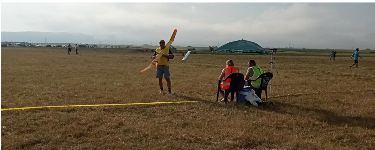
Waiting to Launch