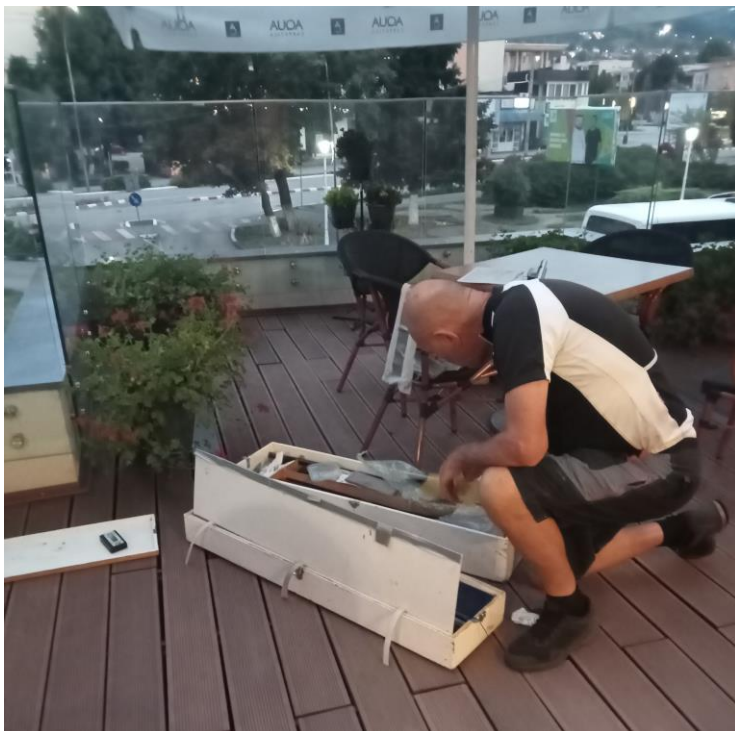
6am for processing